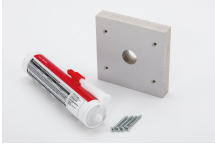
11345 - Fireproof cable entry