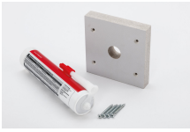
11345 - Fireproof cable entry