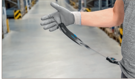
Knife at the moment of release.