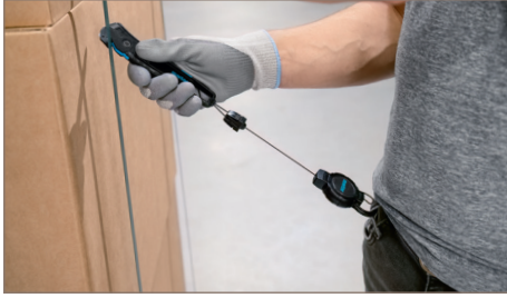
Knife in use.