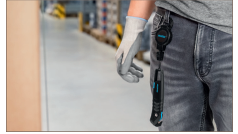
Knife at rest (without open blade).