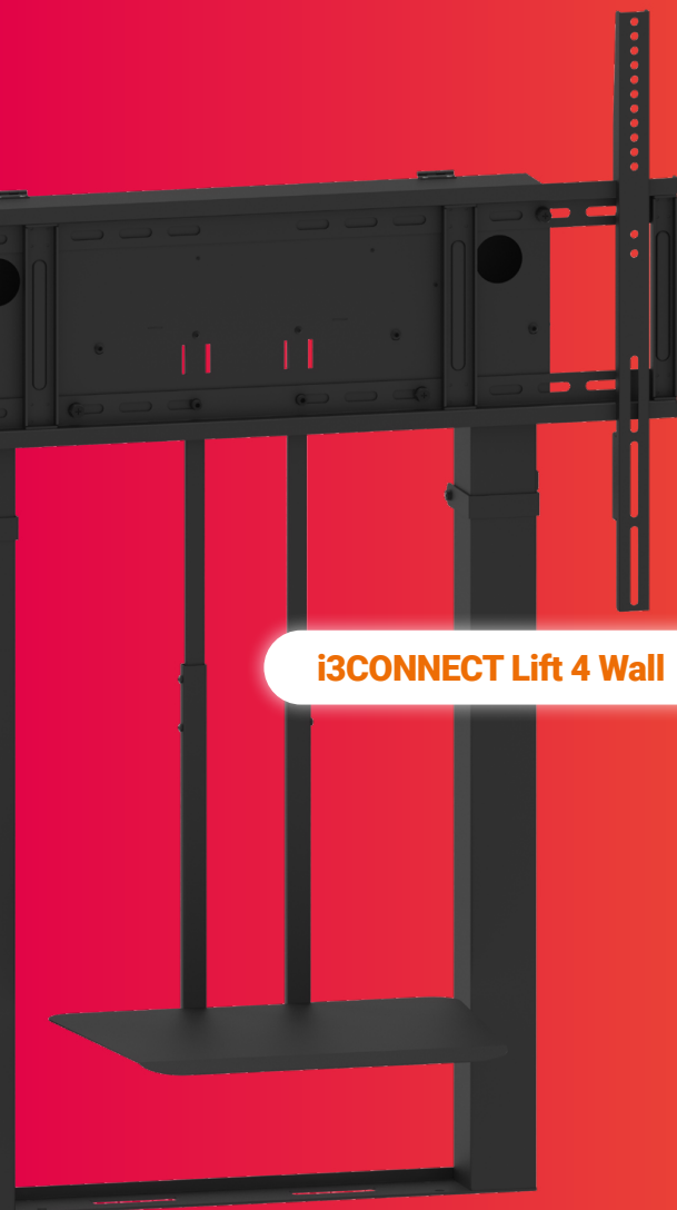
i3CONNECT Lift 4 Wall