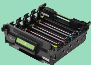
Drum Unit DR625CL