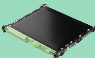
Belt Unit BU635CL