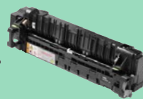
Fuser Unit FD-5000