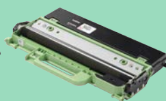
Waste Toner Box WT229CL