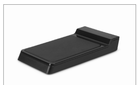
TimeMoto RF-150 USB RFID Reader Art. no: 125-0605