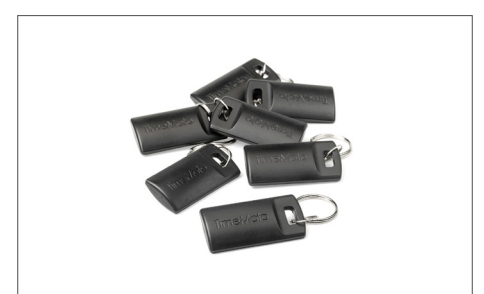
TimeMoto RF-110 set of 25 RFID key fobs Art.no: 125-0604