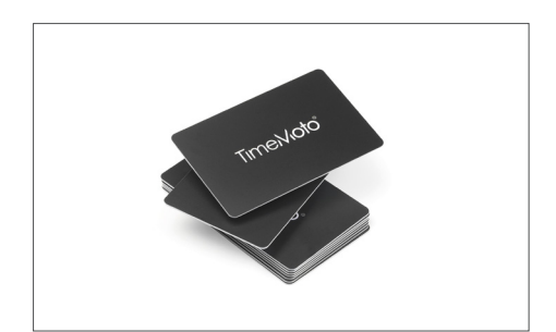
TimeMoto RF-100 set of 25 RFID badges Art. no: 125-0603