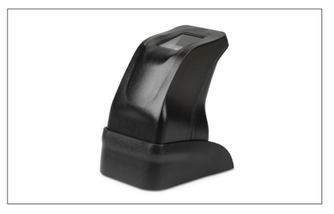
TimeMoto FP-150 USB Fingerprint Reader Art.no: 125-0606