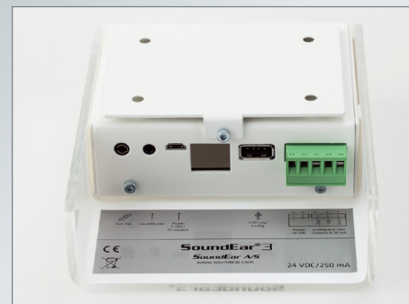
SoundEar®3 - grav