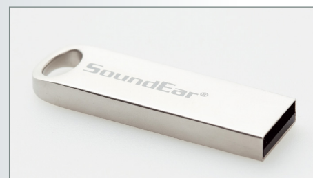
USB nøgle til aflæsning af data