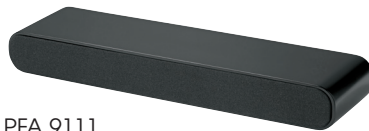
PFA 9111 Video conferencing loudspeaker