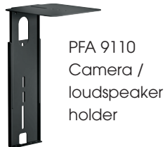
PFA 9110 Camera / loudspeaker holder