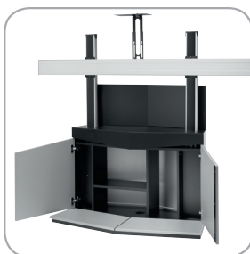
Front side of the furniture