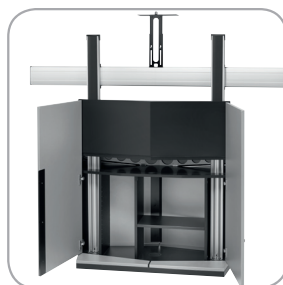
Back side of the furniture