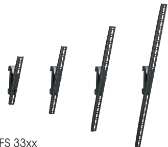
PFS 33xx Connect-it interface display strips