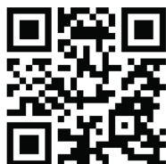
PFF 5211 movie