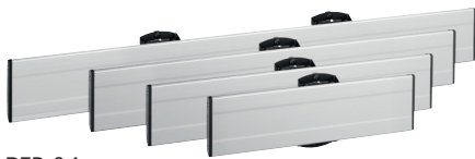
PFB 34xx Connect-it interface bars